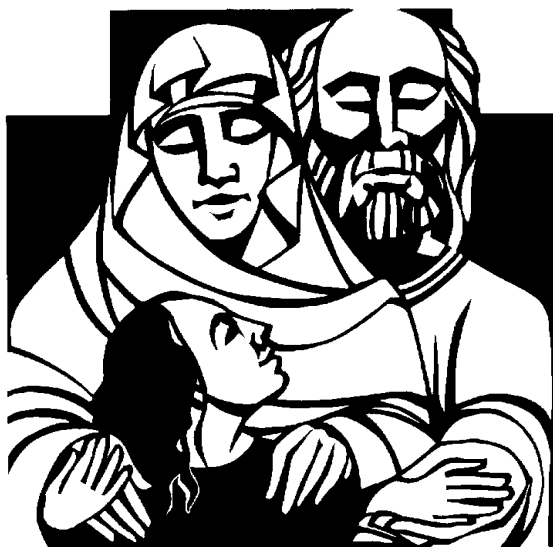
SS. ANNE AND JOACHIM